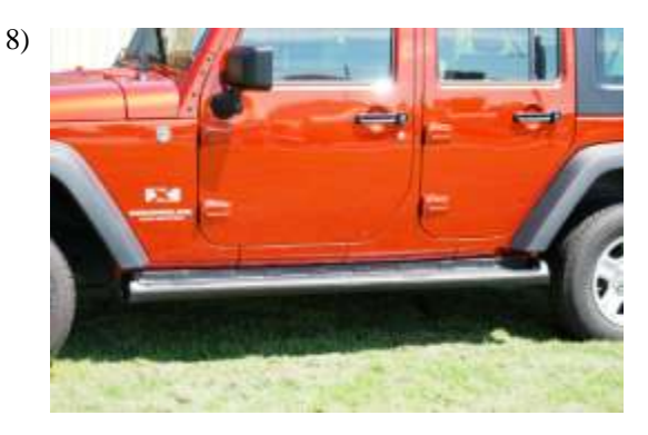
Apply step tread and logo. Repeat steps for opposite side.