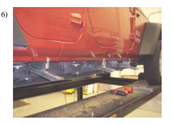
Attach channels to the body mounting Brackets you just installed, hand tighten making sure to keep channels level to body.