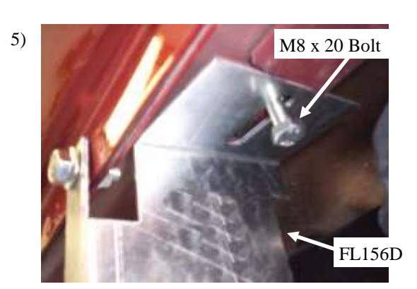
Attach bracket with 1 slot to vehicle at measured location 62". The rear locations use an 8mm bolt and a factory threaded hole. Straighten bracket and bolt through pinch weld.