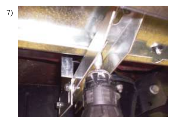
Place the board on the brackets. Attach with self drilling screws. You may need to adjust channels for level and Straightness.