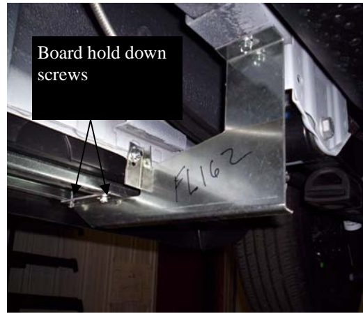
Fig. 14 shows screw locations .

Once board is located left to right and is straight you are ready to attach board to brackets. This vehicle being so low to the ground, you have to mark bracket slot locations rather than drill them on the vehicle. Fig.# 13 shows screws being run in with board on vehicle