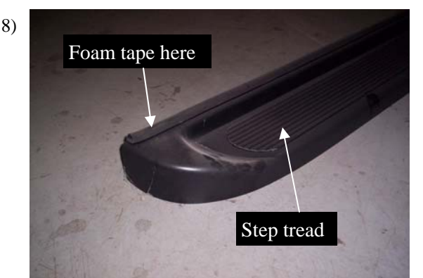
On ABS boards only, apply foam tape and step tread as shown in picture. Center step tread between the ends of the board and keep close to outside edge.

10) Level board and tighten all and any loose nuts and bolts. Repeat for other side.