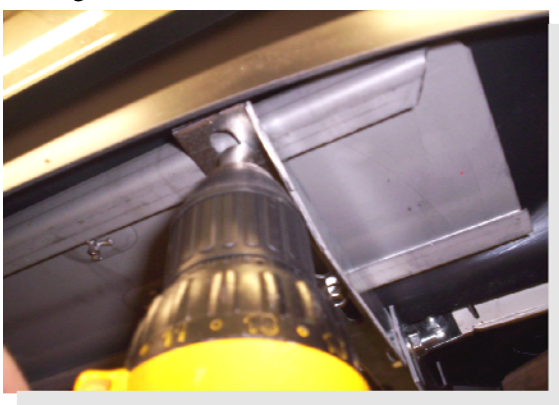
For Molded Boards: Position board where you want it. Install self tapping bolts through bracket into the shoulder of the steel channel on the bottom of the board.