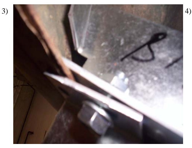
Install BRKT assembly to vehicle by attaching FL90 under the pinch weld and BT39 on top of pinch weld.

Assemble FL90, BT39, and 3124F with a 5/16 flanged nut and bolt as shown. Snug, but don't tighten yet.