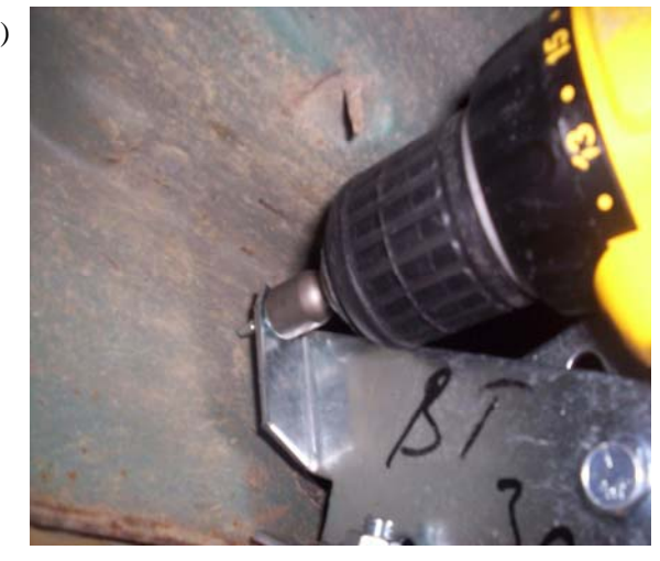
Insert a self tapping bolt through BT39 into vehicle body and tighten. Next tighten the two 5/16" nut and bolts that attach the BT39 and FL90 together.

Owens Products Inc. • 1107 Progress Street • Sturgis, MI 49091 • 269-651-2300 • Toll-Free:800-726-9367 • Fax: 269-651-9326 • www.owensproducts.com