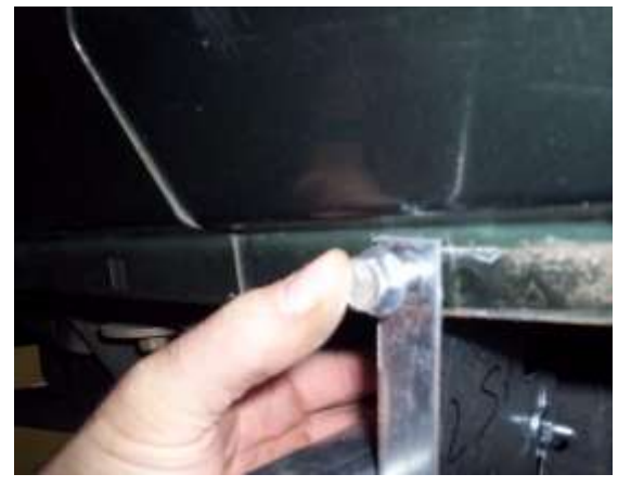
Insert a 5/16" flange bolt trough pinch weld and FL223 and FL232 tighten with a 5/16" flanged nut. (BRKT show on outside of pinch weld for picture purpose only, BRKT mounts to inside of pinch weld)