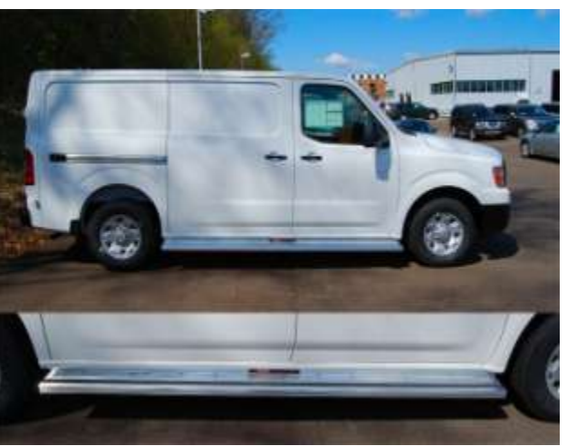
Level and center board, tighten all and any loose nuts and bolts. Repeat for other side.