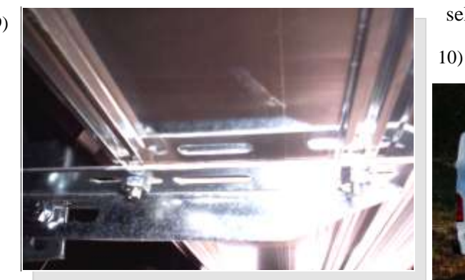
Attach 3124F to FL223/FL232 using 5/16" nut and bolts, Snug but don't tighten. Place the board on the brackets with the bolts through the slots. Fasten with 1/4" nuts.