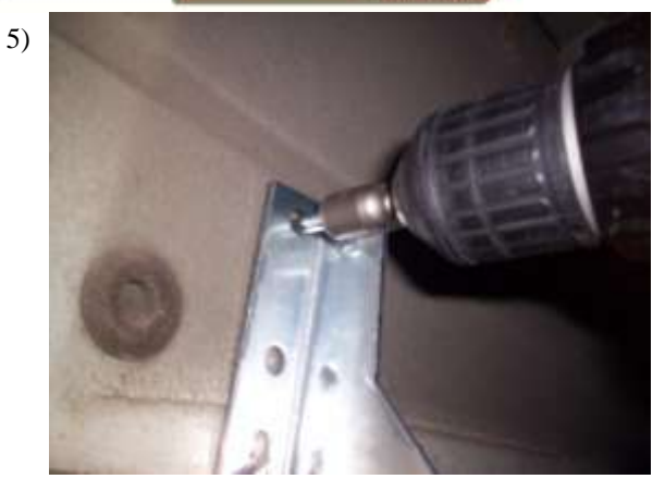
At remaining locations install two self tapping bolts through slot in FL223 and FL232 ( Different BRKT shown )