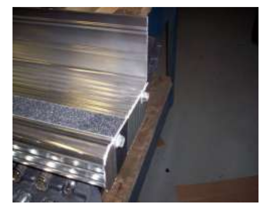
Attach the end caps to the board with 3/8" self threading bolts. (extruded board shown)