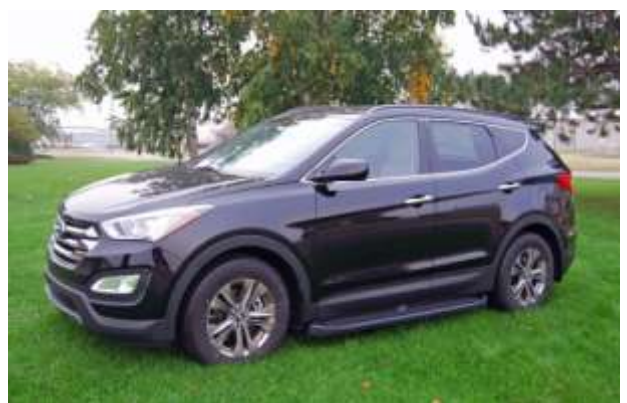
Repeat all steps to opposite side. Enjoy your Owen's running boards.

NOTE: To allow for easier mounting, with a sharpie mark the 6 locations where the self tapping screws will be located. Remove the board from the brackets and drill pilot holes in the marked locations with a 3/16 drill bit. Place the board back on the brackets and mount