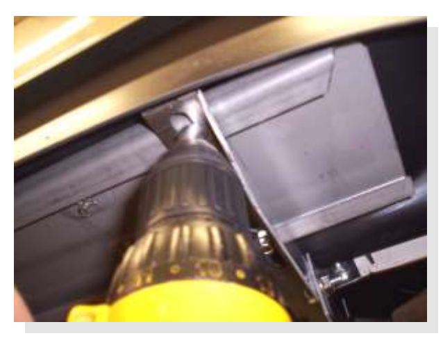
<u>STEP 11</u> : Attach the board to the brackets by inserting self tapping screws through the slot in the bracket and into the metal channel on the bottom of the running board as shown in the figure above.

NOTE: To allow for easier mounting, with a sharpie mark the 6 locations where the self tapping screws will be located. Remove the board from the brackets and drill pilot holes in the marked locations with a 3/16 drill bit. Place the board back on the brackets and mount