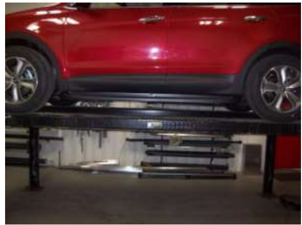
STEP 10: Make sure all fasteners are tightened on all bracket locations. Place board on the mounting brackets. Position the board so it is even front to back. Also make sure the back side of the board is approximately 3" away from the pinch weld.

Note: No Drilling into the vehicle is required