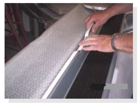
STEP 9: Apply foam tape to the top side of the board where it will meet the vehicle. Make sure the surface is clean and dry.

STEP 8: Place an M10 tab nut in to the hole in the rocker panel where the rubber plug was removed. Place an M10 bolt through the large hole of a BT73 on the SWB, and a BT76 on the LWB. Snug this bolt up to the rocker panel. Bolt the lower side of the BT to the top flange of the FL252 as shown in the photo with a 5/16 nut and bolt.