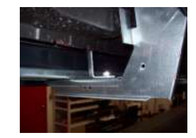
STEP 6: Mount a BT75 between BT72 and CB78 with a 5/16x 3/4" bolt and nut on both ends. The picture shows the complete 29" bracket location installed.

STEP 8: Place an M10 tab nut in to the hole in the rocker panel where the rubber plug was removed. Place an M10 bolt through the large hole of a BT73 on the SWB, and a BT76 on the LWB. Snug this bolt up to the rocker panel. Bolt the lower side of the BT to the top flange of the FL252 as shown in the photo with a 5/16 nut and bolt.